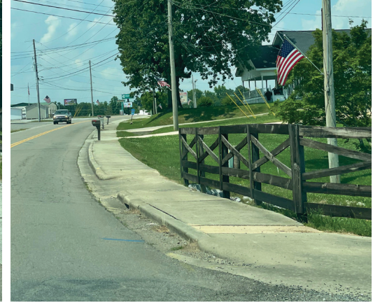
Looking north towards State Route 157