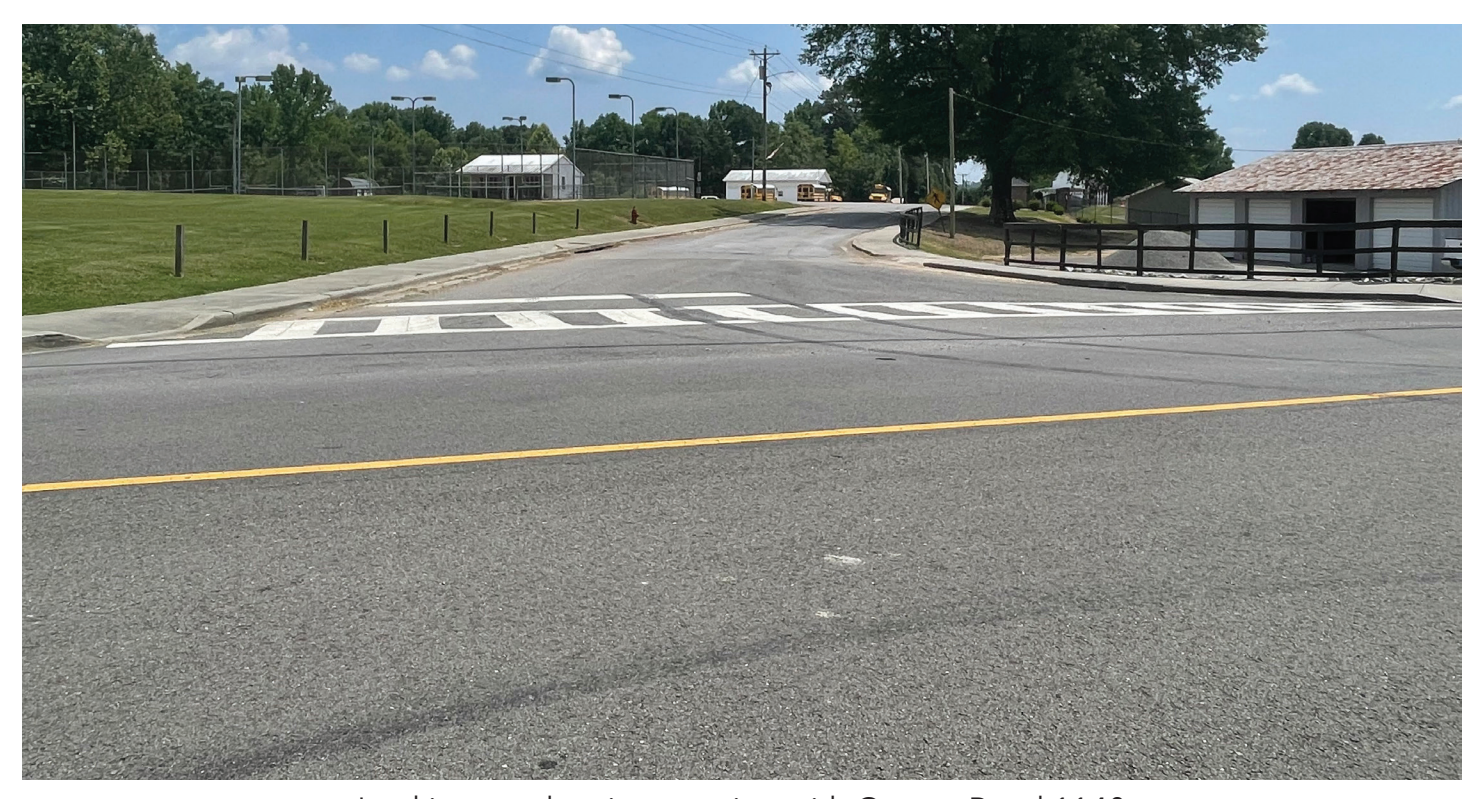
Looking south at intersection with County Road 1140