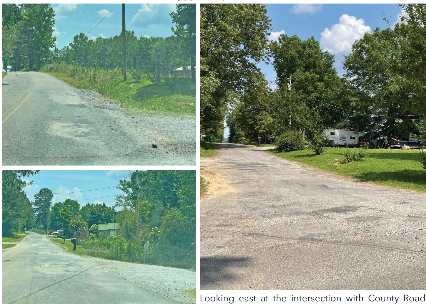
Looking east at the intersection with County Road 1128