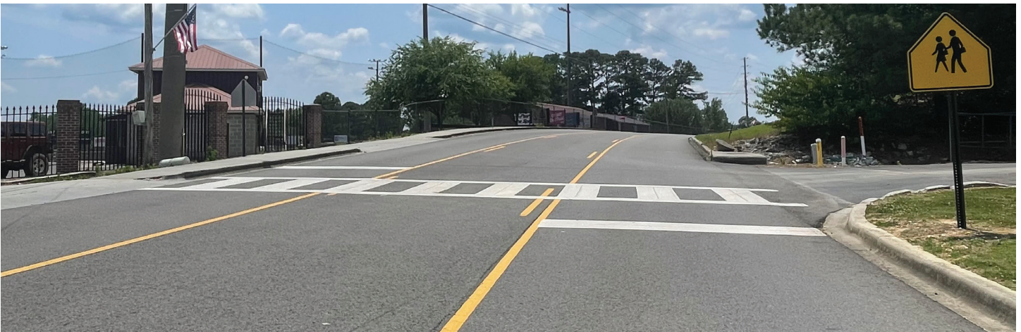
Pedestrian infrastructure near the schools