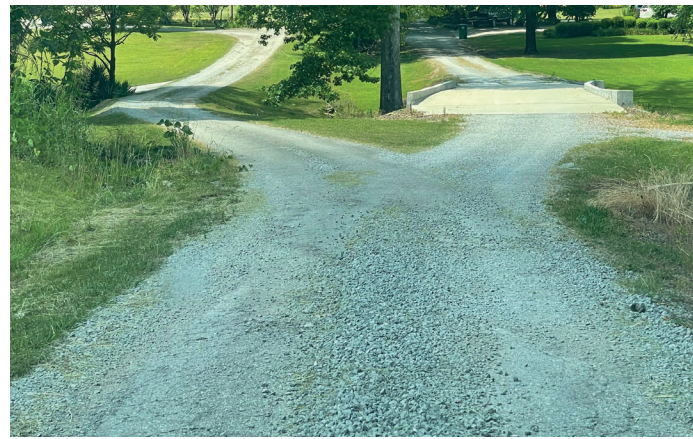
WEST POINT STREET ASSESSMENT