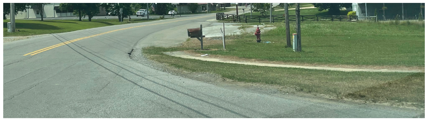
Looking north from intersection with County Road 1141