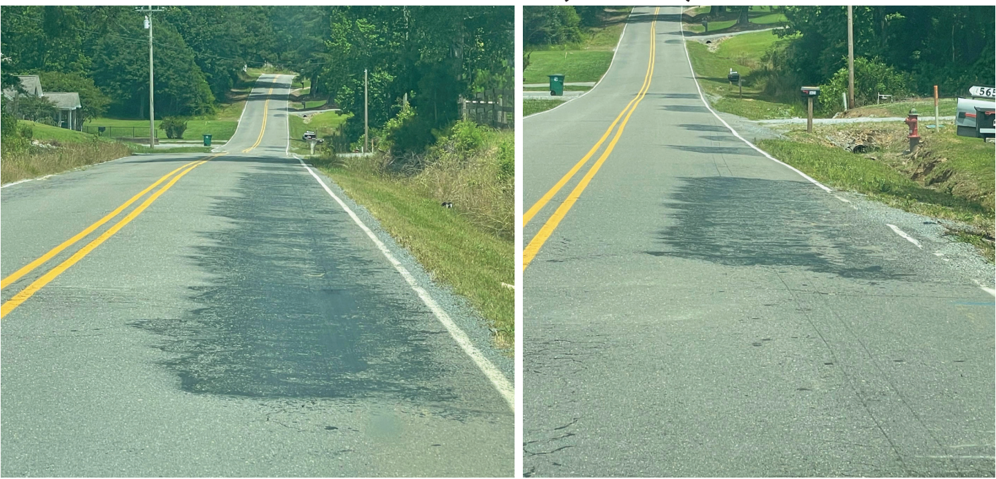
Looking east between the intersection of County Road 1127 and the Methodist Church