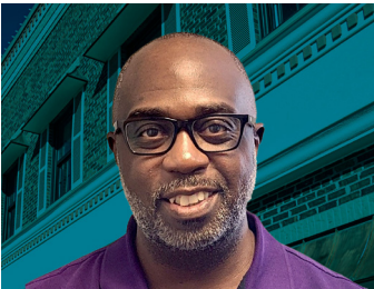
Brenson Parks Human Resources